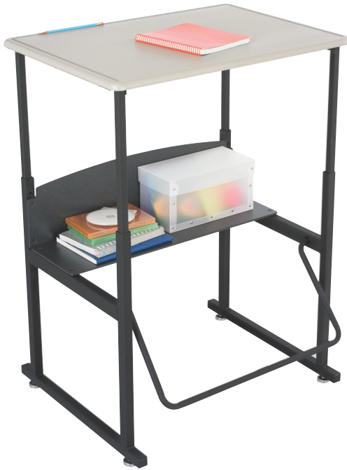
1201BE, STANDARD TOP