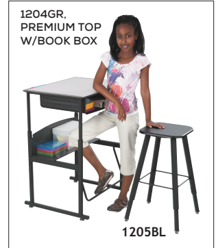
1204GR, PREMIUM TOP W/BOOK BOX