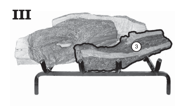
Final Log Placement