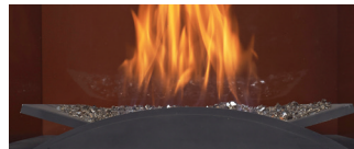
CRYSTALINE™ Glass Burner Assembly