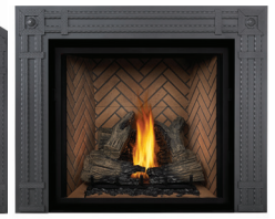
Rectangular Decorative Surround Wrought Iron Finish