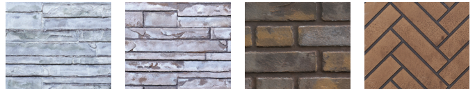
Decorative Brick Panels Antique White LEDGEROCK, Custom Blend LEDGEROCK, Newport™ or Herringbone