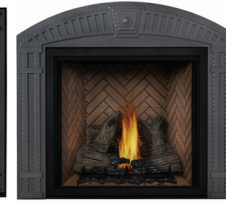
Arched Decorative Surround Wrought Iron Finish