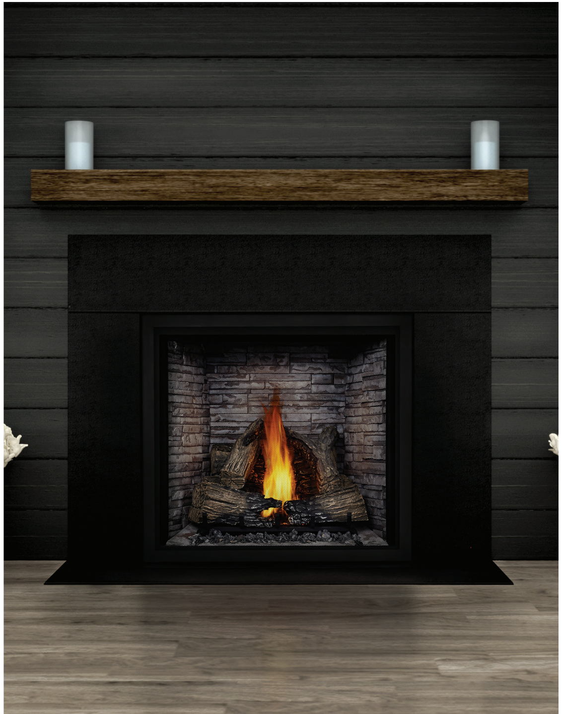
STARfire™ 35 shown with standard safety barrier