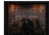
Exclusive NIGHT LIGHT™ Convenient Remote Control