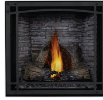
Decorative Front with Screen Painted Black Finish