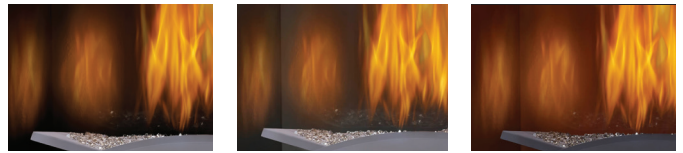
MIRRO-FLAME™ Porcelain Reflective Radiant Panels Black, Platinum or Cappuccino