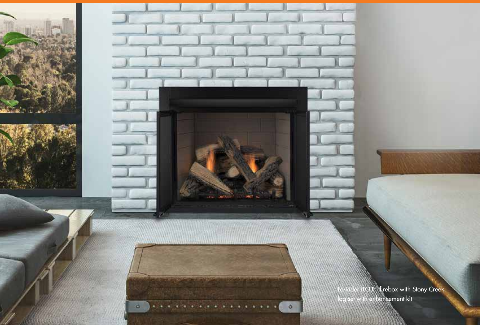
Lo-Rider (LCUF) firebox with Stony Creek log set with enhancement kit