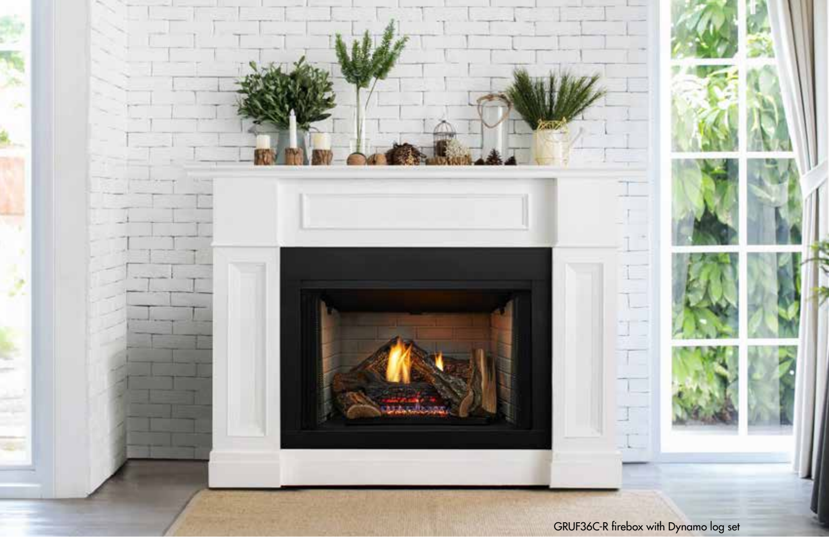
GRUF36C-R firebox with Dynamo log set