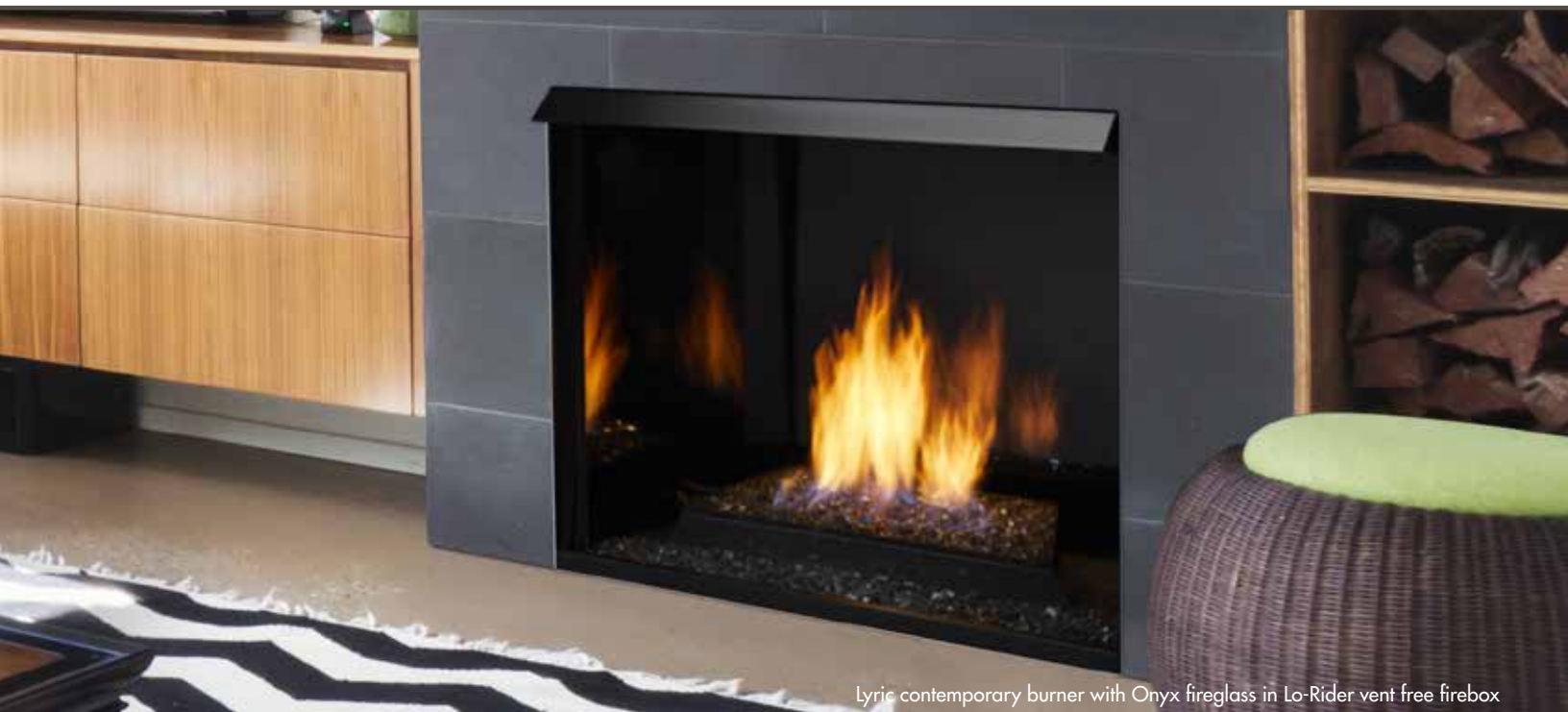
Lyric contemporary burner with Onyx fireglass in Lo-Rider vent free firebox