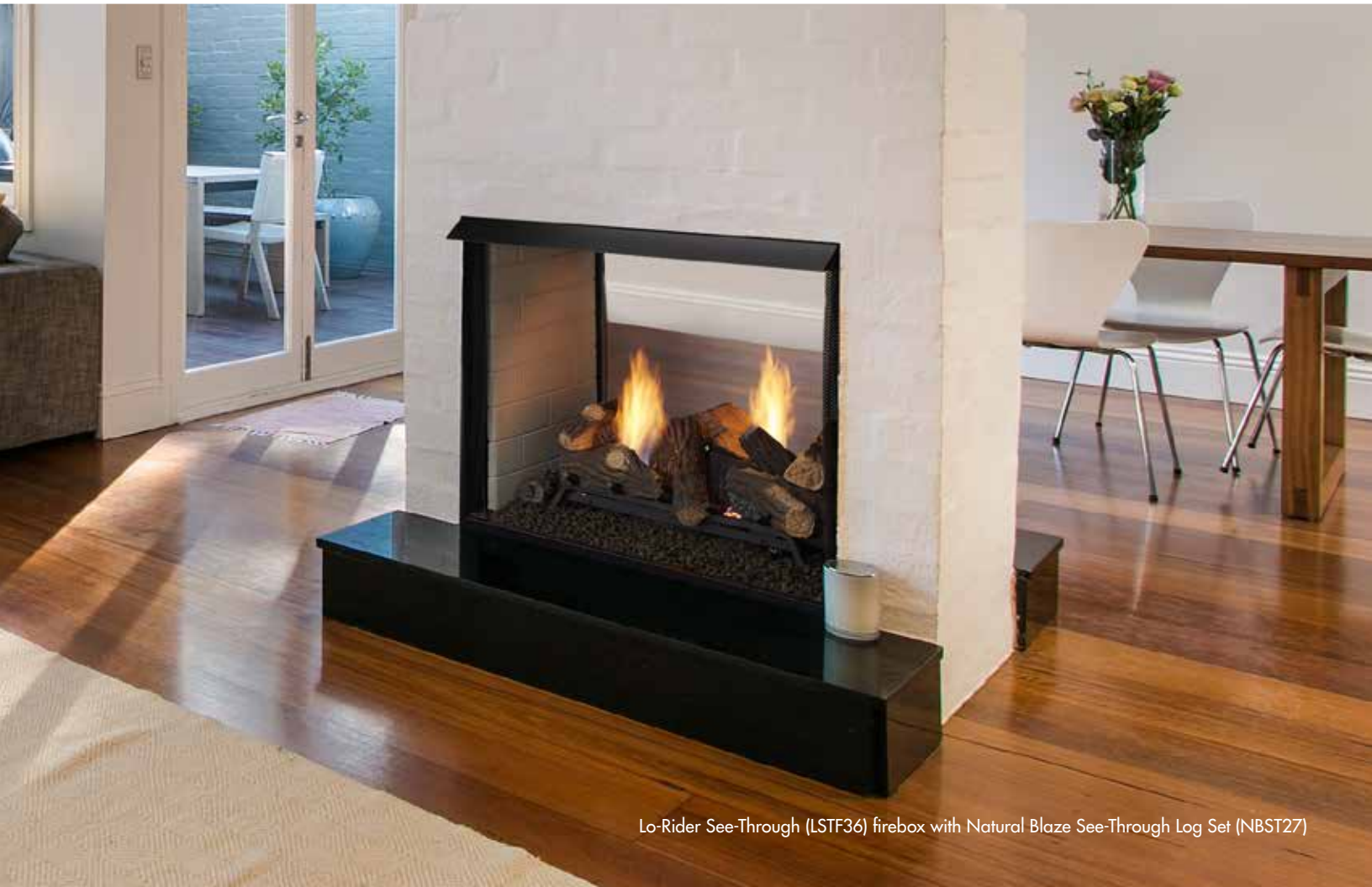
Lo-Rider See-Through (LSTF36) firebox with Natural Blaze See-Through Log Set (NBST27)